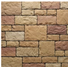
Wheat / Cabernet Blend