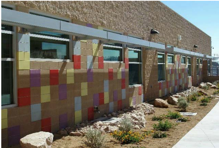
Ruby Duncan Elementary School - Las Vegas, NV

Constructed in a recently developed neighborhood in North Las Vegas, the color palette for Ruby Duncan Elementary was chosen to provide a lively kid-centric contrast to the monochromatic tones of the surrounding natural landscape. By using Astra-Glaze-SW+ glazed masonry units, the architect was able to utilize both color-blocking and a confetti pattern to create an identity for the school that's as vibrant as the school's namesake.